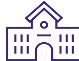
Human Sciences esp. Department of Political Science and Sociology