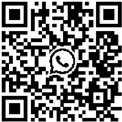
What's App Channel