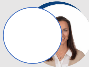
N.N. Business Marketing