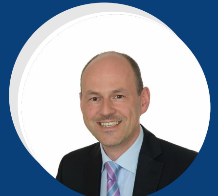
Dean of Studies