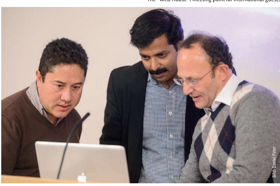
The "Welz House": meeting point for international guests

other facilities. The entire building is a non-smoking area. The flats are fully furnished, of various sizes and each contains a bathroom/shower and a kitchenette. The monthly rent includes internet access, use of shared facilities, electricity and heating costs and also covers the weekly joint fellow dinners and free access to all events taking place at the Welz Haus.