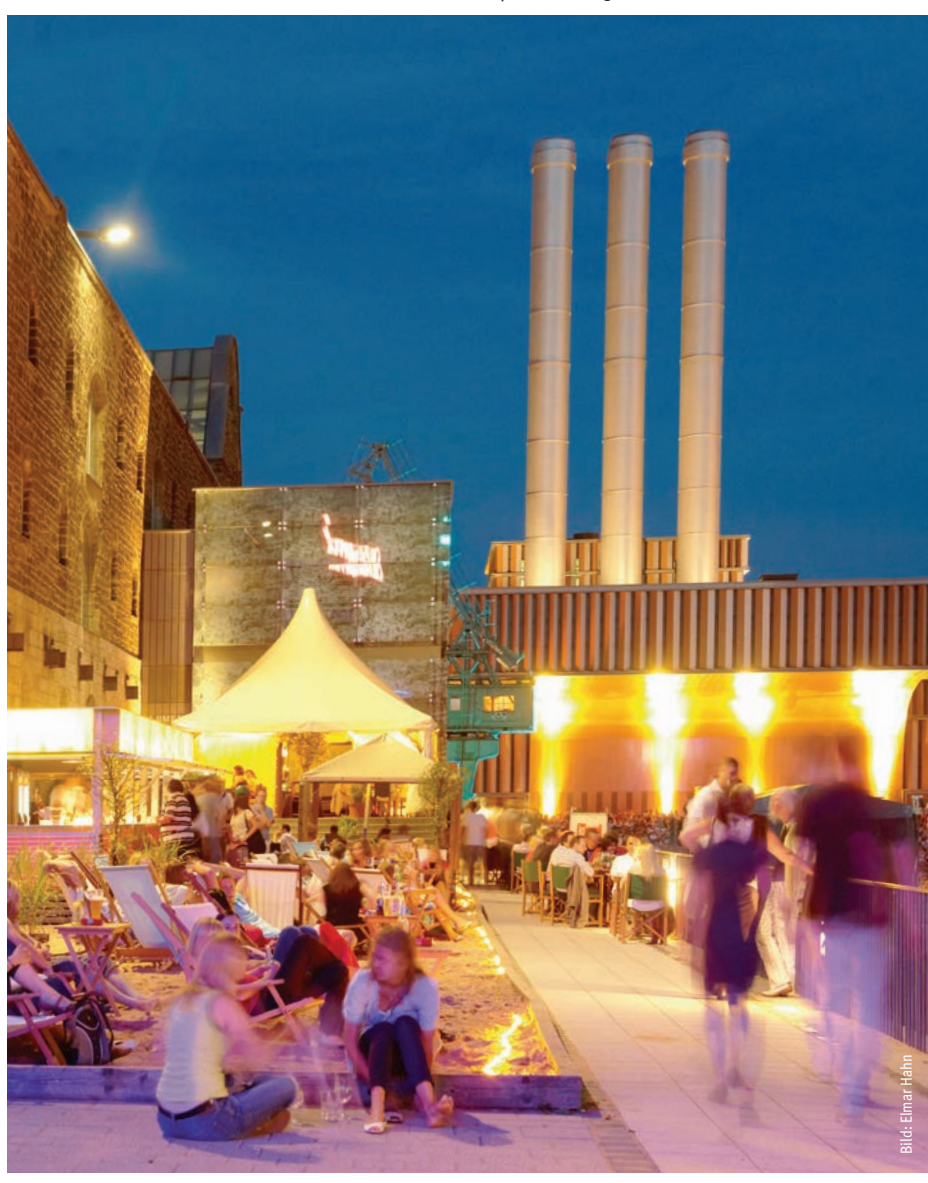
Open-air feeling at the Old Harbour

58 Welcome to the University of Würzburg