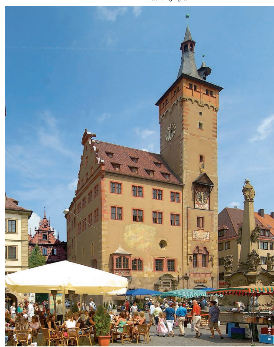
The Town Hall "Grafeneckart" is one of Würzburg's historic highlights

Opening Hours vary throughout the week. Check on the internet before you intend to go there!