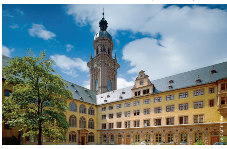
The Old University – home of the Faculty of Law

As early as the 1990s, the University began founding cross-faculty research centres and opening up new research areas and possibilities for innovative degree programmes. These interdisciplinary centres, for example the Research Centre for Infectious Diseases and the Biocentre, have become internationally prominent trademarks of the University of Würzburg. The scientific standing of the University also shows in its numerous collaborative research activities funded by the German Research Foundation (DFG): Würzburg scientists have continuously been able to raise funding for collaborative research centres, research training groups and research units against tough competition. In 2002, the University of Würzburg launched one of the three Centres of Excellence funded by the DFG across Germany: the Rudolf Virchow Centre/Centre for Experimental Biomedicine. Those activities have pushed the University into the top tier of German academic research institutions. On an international level, the University also ranks among the top in many scientific disciplines including biology, chemistry, medicine, physics and psychology.