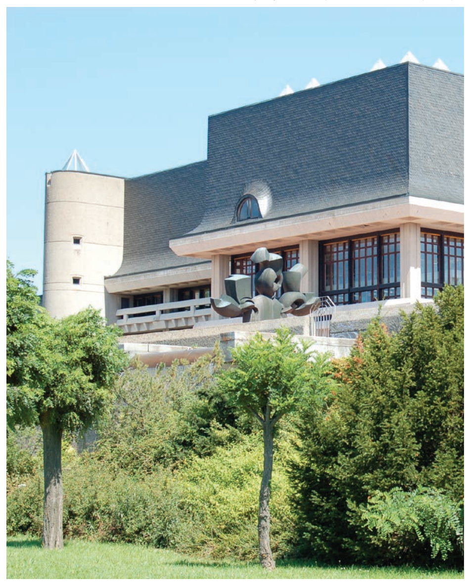
A quiet place for studying: the central University Library

With a library card you can also request literature that is not available in Würzburg through in-